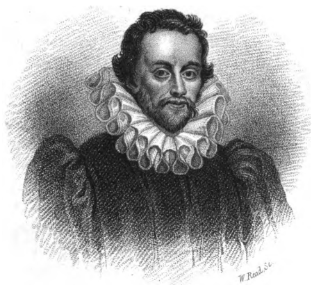
SIR EDWARD COKE.