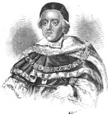
SIR MATTHEW HALE.